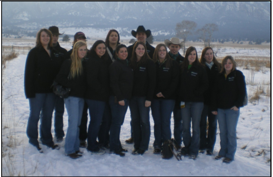
2009-2010 University of Saskatchewan Range Team

The Team was sponsored by the Prairie-Parkland Chapter and other organizations, and the team is very appreciative of the generous donations that made it possible for them to compete and network with other range people. They went on a technical tour of conservation practices on ecologically significant grassland between Denver and the Rocky Mountains. The trip was a great experience for all, and they are anxious to start preparing for next year's contest in Billings!